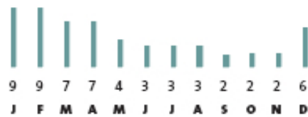
Average rainfall (inches)