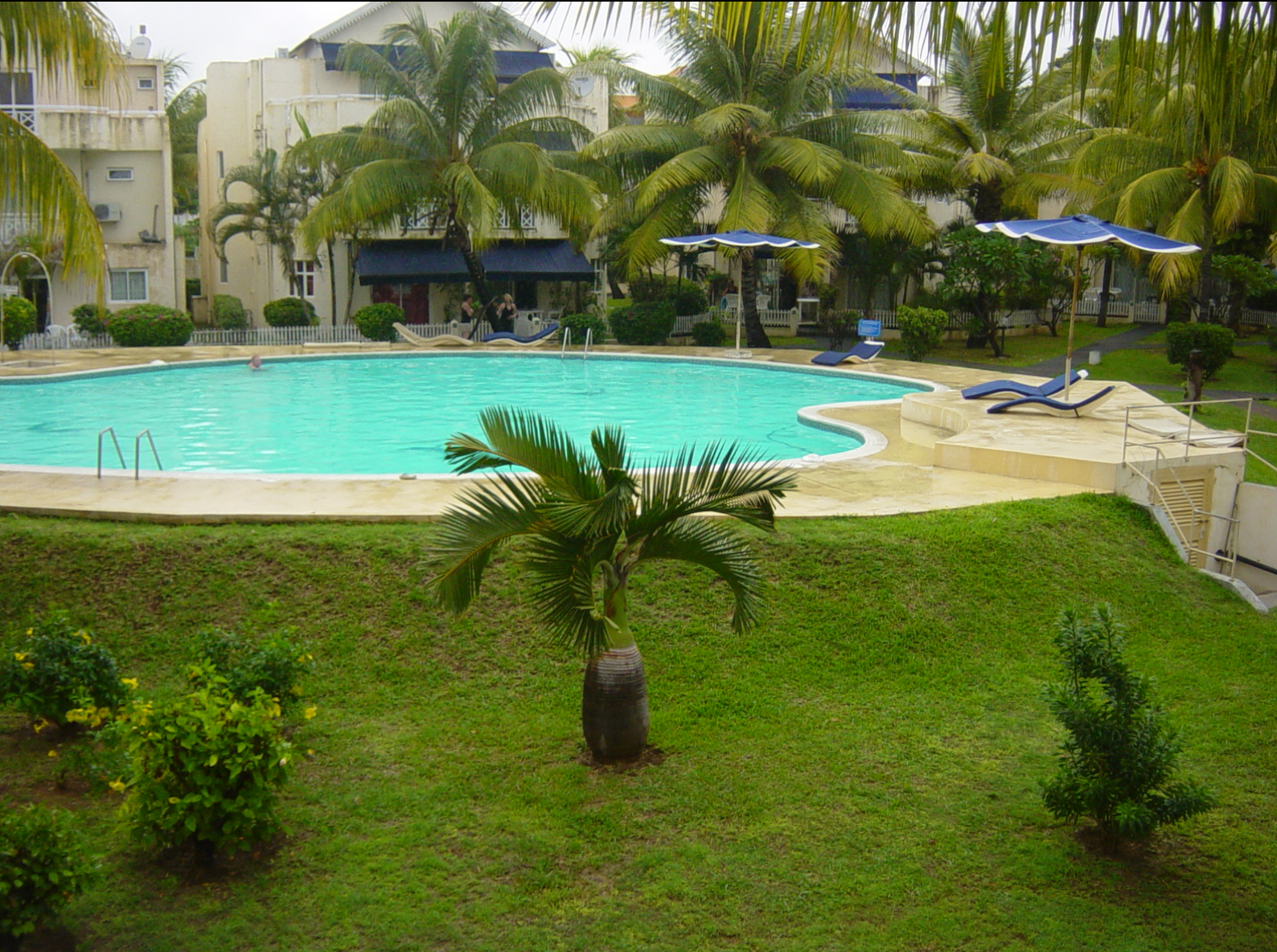
Balcony view from villa